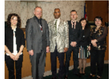
Visiting Delegation at the DeKalb Court

The delegation had an intensive schedule of visits at State Court of DeKalb county, meetings with judges while learning the process of the court system in the United States; as well as visiting Georgia Court of Appeals. The delegation visited law schools around Georgia: Emory Law School, meeting with Professors; University of Georgia in Athens Georgia where they met with the Associate Dean of the Law School and enjoyed lunch with professors, and John Marshall Law School where they met with professors of Law department. The visit was not all full of busy work and meetings, but also full of fun activities around Atlanta. The delegation visited Atlanta Aquarium, Coca-cola Enterprises, National Museum of Patriotism, enjoyed dinner with Hall Booth Smith & Slover attorneys, and visited Georgian families. The visit was a great success and many wonderful friendships and business opportunities were established.