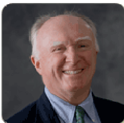
On teaching Seminar: