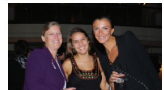
Guests enjoying 3rd Annual Taste of GE