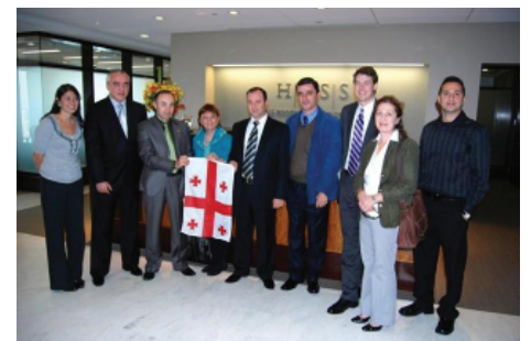
Delegation visiting Hall Booth Smith & Slover PC, Atlanta, GA.

Coca-Cola museum, and CNN Center. Many of the Georgians said their favorite experience while exploring Atlanta was an unforgettable visit to the Hawks game where they had an opportunity to meet with Zaza Pachulia, who is a native of Georgia.