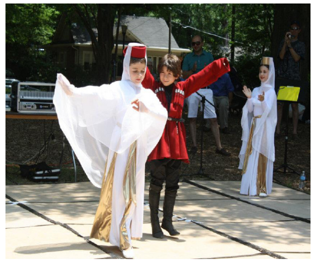
Young Georgian Dancers perfomring Simidi Dance

The 2nd Annual Georgian festival is planned for May 12, 2013 and we encourage each one of you to participate.